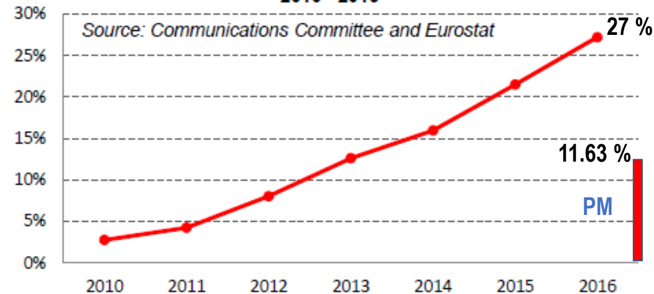
Households with an ultrafast broadband (at least 100Mbps) subscription, 2010 - 2016